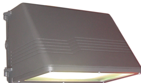
Guth SUNDOWNER LED wall pack

The new line consists of five models containing from 4 to 40 LEDs for scenarios ranging from doorway lighting to 20-foot-high mounting applications. Instead of only illuminating the ground like conventional wall packs, the fixtures take advantage of the LUXEON LED's physical and optical properties to distribute light uniformly over a 60-degree field for partial wall coverage. Benefits include: