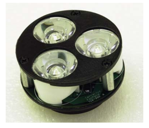
TerraLUX TLE-300, the World's Brightest Flashlight Upgrade, using LUXEON K2 with TFFC.

"When you're trying to sell to a wholesale supply chain with 300 stores and you have only one product as we did with our first LED upgrade kit, it has to be a home run. These companies typically don't take on vendors for just one product," Kalin noted. "LUXEON LEDs enabled us to instantly differentiate our light engines from anything on the market and provide concrete, measurable, sit-up-and-take-notice benefits for flashlight users, and LUXEON's reliability and dependability keeps them coming back. Philips Lumileds set the standard in their industry, and they have allowed us to do the same in ours."